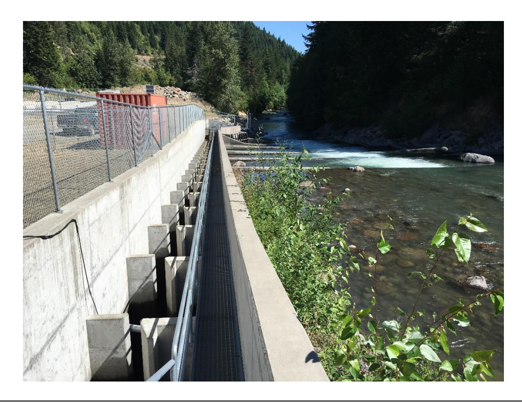
Figure 4: Fish ladder located on the Hood River in Oregon, allowing salmon passage around a small obstruction in the main channel of the river. Water flows down the channel, but its flow is slowed by the concrete barriers. Such structures can help fish navigate smaller obstacles but are often not feasible options for allowing passage around larger dams.

Despite taking criticism for appearing too soft on hydroelectric operations, the NMFS has not been able escape the influence neoliberalism and has been limited in what they can do for purposes of conservation anywhere that their actions conflict with economic activities (specifically the operation of hydroelectric dams), private property rights, or could be interpreted as an unnecessary extension or overreach of federal authority. For example, to mitigate the impact of dams on salmon, the predominate