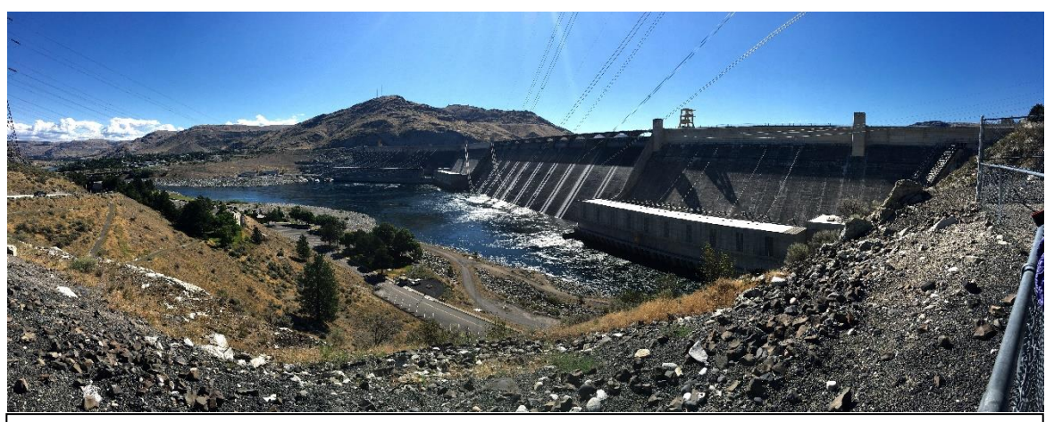
Figure 3: Grand Coulee Dam

Mitigating the impacts that hydroelectric dams have had on salmon is complicated by the fact that many of the largest dams in the Columbia basin were built during the 1930s and to a lesser degree the 19440s, and predate any legislation that sought to protect and improve salmon populations. For example, the impressive Grand Coulee Dam (Figure 3), the largest hydroelectric dam in the basin and one of the largest in the world, began generating electricity in 1941 (Northwest Power & Planning Council 2008). This means that they were constructed without any regard to fish passage (a requirement