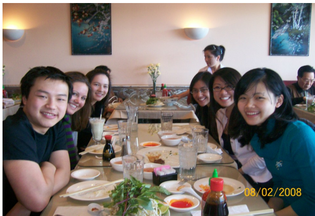
AASU celebrated Chinese New Year at a Denver Vietnamese restaurant