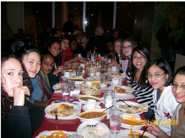
SASA takes their members out for dinner at Mirch Masala

SASA: Young South-Asian Americans are often not able to identify the culture of their ancestors if they have not been brought up in South Asia; they do not identify themselves as South Asians. SASA helps these young adults become aware of their ancestral traditions and celebrate it!