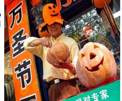
Jack-O-Lanterns in China

During the Halloween season, Chinese citizens also have a festival called The Feast of the Hungry Ghosts. These ghosts are referred to as "hungry" because they were not given a proper