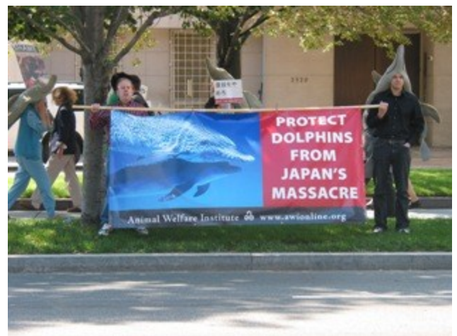
Washington D.C. Protestors wearing dolphin costumes.

front of the Japanese Embassy in Washington DC. The protestors had the typical signs and chants, but also they proceeded to act out the dolphin hunt that takes place in Taiji, Japan every fall. The "dolphins" proceeded to crouch in the group and whine and scream as the "fishermen" danced around them thrusting spears and yelling "DIE!". While demonstrations like this do nothing to stop Japan from continuing these hunts, they do serve a purpose for spreading awareness. No matter how poor the protestors' acting skills!