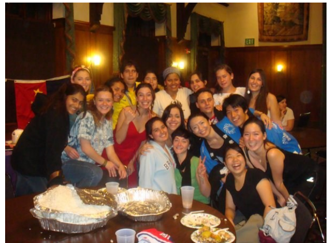
MOSAIC's Taste of the World

CARNIVAL: food, fun, and busting open piñatas to honor international students