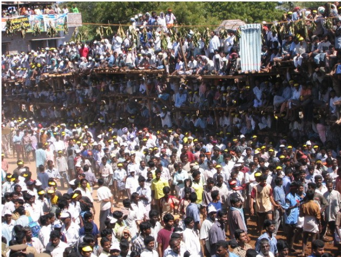
The Crowds of India