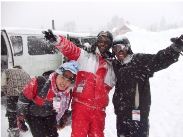
MOSAIC ski trip

INTERNATIONAL AWARENESS WEEK involves a variety of activities including cultural presentations, performances, guest speakers, film screenings, and Taste of the World.