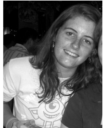
Emily Ziolkowski Educational Reforms in Response to a Globalized and Internationalized Youth in Japan