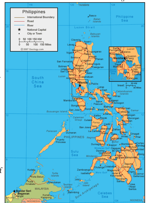
Map of the republic of the Philippines